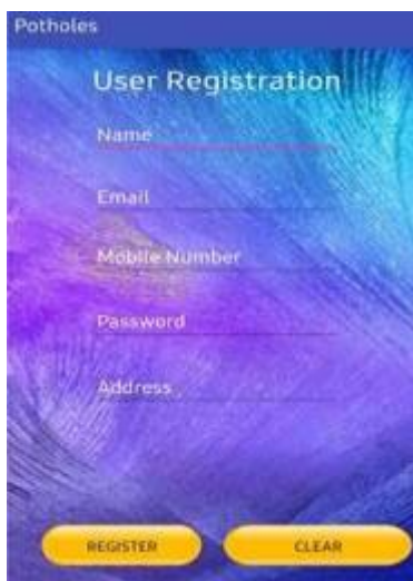
Figure 2. USER REGISTRATION PAGE

User Registration Page is the second page of the android application used for registration of the new users. In the android application once the user is registered to the