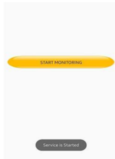
Figure 4. MONITORING PAGE

Monitoring Page comes after login in successfully to the android application. This page is used to monitor the road using the ultrasonic sensor and a GPS sensor. In this ultrasonic sensor calculates the distance and notify the user if the depth or distance of the pothole is too deep.