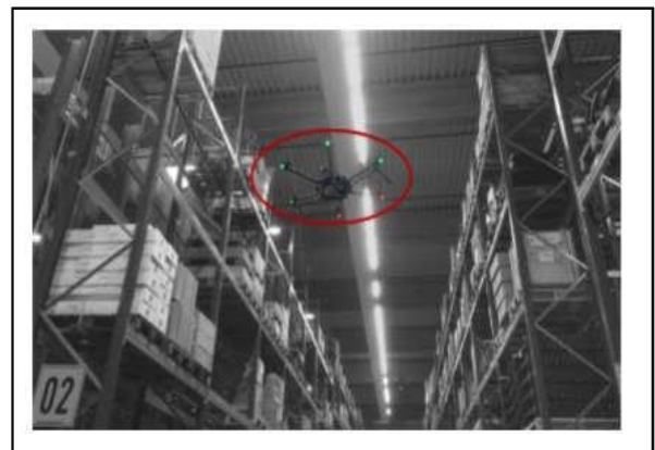
Fig.3 MAV performing the inspection task in warehouse

The radio frequency identification (RFID) is used to determine and map the stored objects. It is highly fast in speed and able to detect up to 750tags per second. The localization objective is achieved by 6D Lidar which does 3D mapping due to this tracking of MAV also becomes easy. The controlling under high velocity of following accurate trajectory path is fulfilled by Model predictive controller. Two high resolution cameras are provided for continuous recording of images with 3Hz frequency. The MAV automatically reacts towards the obstacles. When any obstacle is determined the MAV stops at a safe distance. The limitation of MAV is that it is unable to detect certain items when high vibrations take place in warehouse. Because of low light intensity or shadow images are not captured and recorded in specific areas. But due to MAV identifying the place of certain item becomes simple and time consuming. MAV consists of enough on board processing power integrated with high bandwidth ground connection and long battery life.