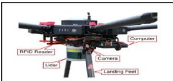
Fig.2 Design of MAV

Marius Beul et al. [2] introduced one of the best method for monitoring the inventory by using the Miniature aerial vehicle (MAV). As there are many applications of MAV's thus it can be applied for monitoring stock in warehouses in indoor and outdoor. The main aim of the MAV is to inspect the stock and items quickly through small passage and cover large area in short time. The MAV is highly robust, adaptable to various conditions and also it is provided by stable navigation systems for its autonomous mechanism.