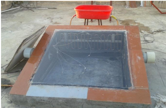
Fig.2 experimental Set Up

we have used K-type thermocouple for measuring the different temperature inside the Masonic solar still. i.e. basin water temperature (T b ), Copper tube temperature (T c ), Interface temperature(T 7 ), inner glass temperature(T 8 ).